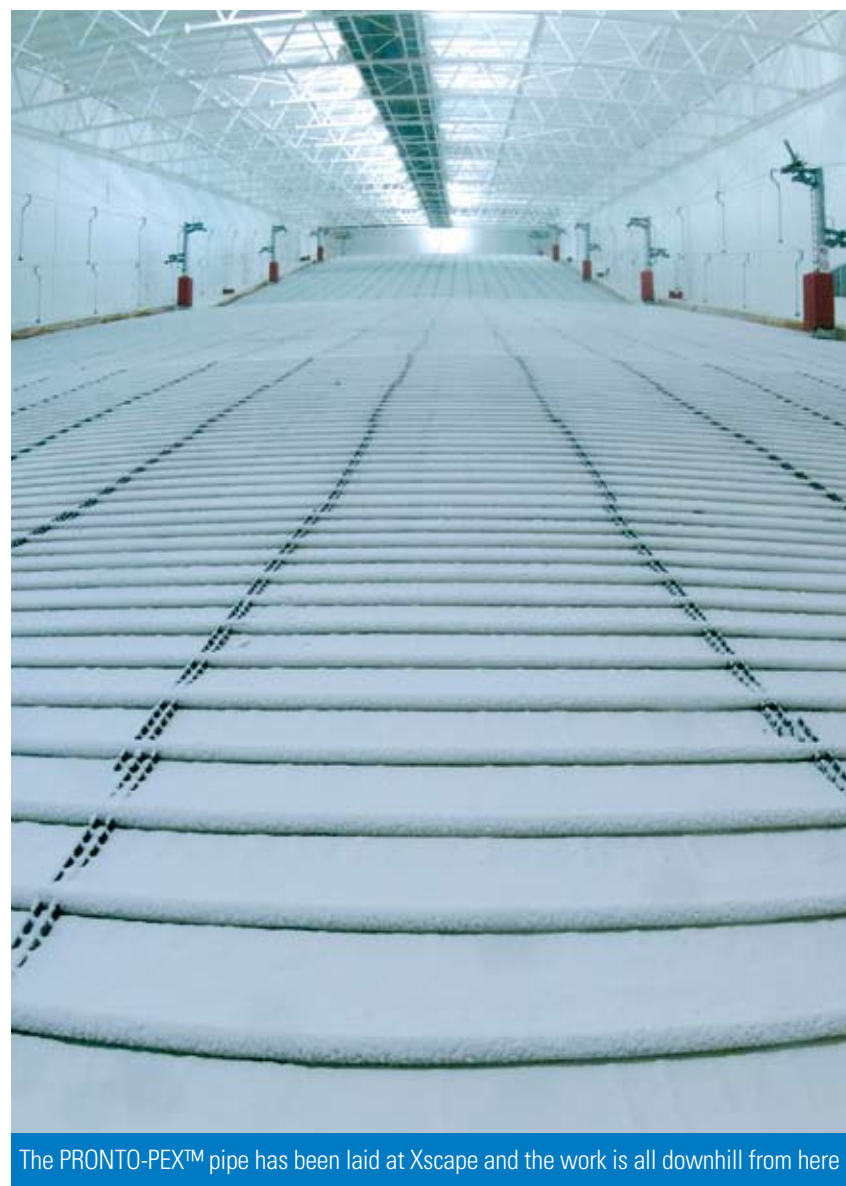
The PRONTO-PEX™ pipe has been laid at Xscape and the work is all downhill from here

PRONTO-PEX™ is supplied direct from Micrex or through appointed trade distribution outlets. It's fully compatible with standard compression and push fit fittings and comes in 10, 15, 22 and 28mm diameters (plus half, three-quarter and one-inch Irish sizes too) in off-the-shelf coils of 25 and 50 metre and in 3 and 6 metre straight lengths.