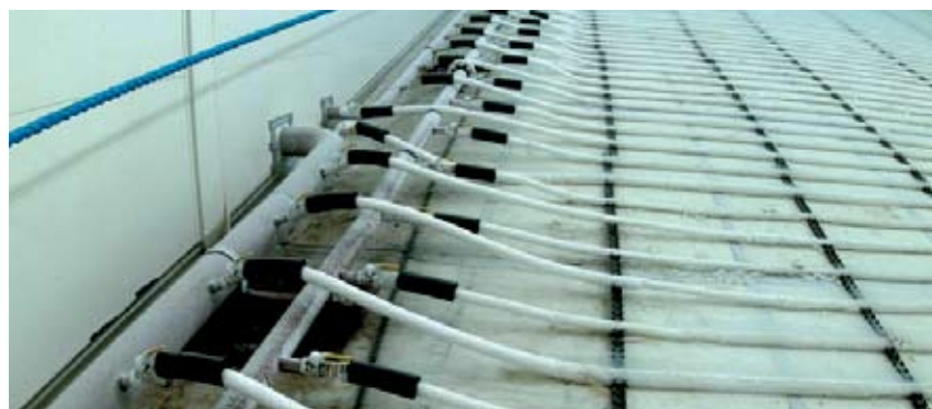
Simple but effective: a manifold system of PRONTO-PEX™ pipe loops

BSI and SKZ-approved, the PRONTO-PEX pipe is ideal for hot and cold water